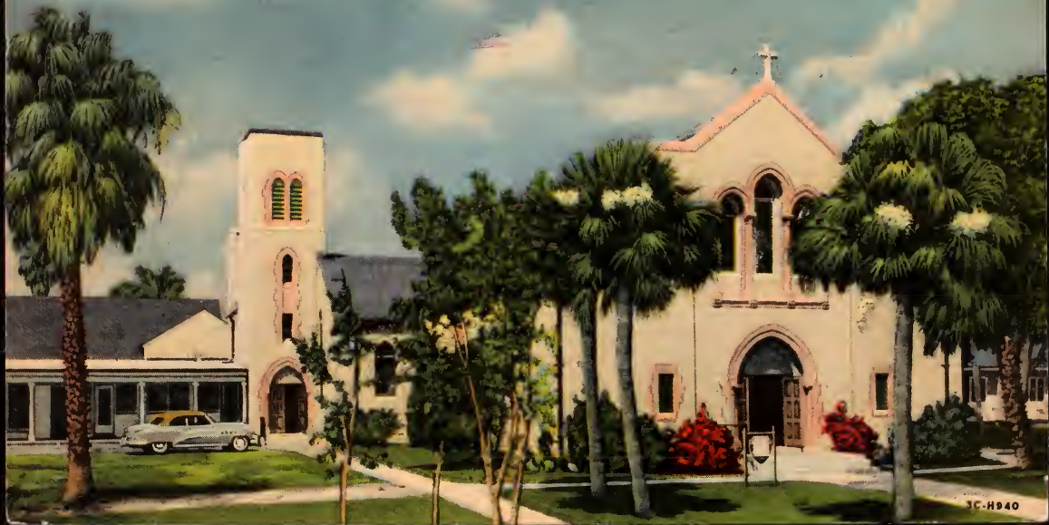
S.86— Episcopal Church of the Redeemer Sarasota, Florida